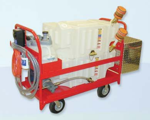
PORTABLE FILTER CARTS