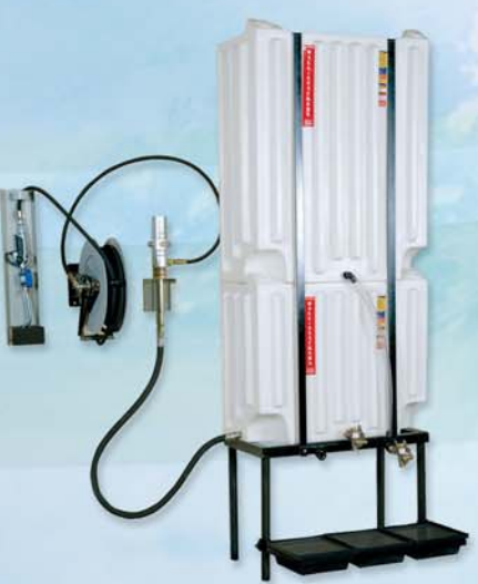
WS71 & WS115 W/ WALL PUMP