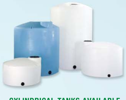
CYLINDRICAL TANKS AVAILABLE UP TO 15,000 GALLONS