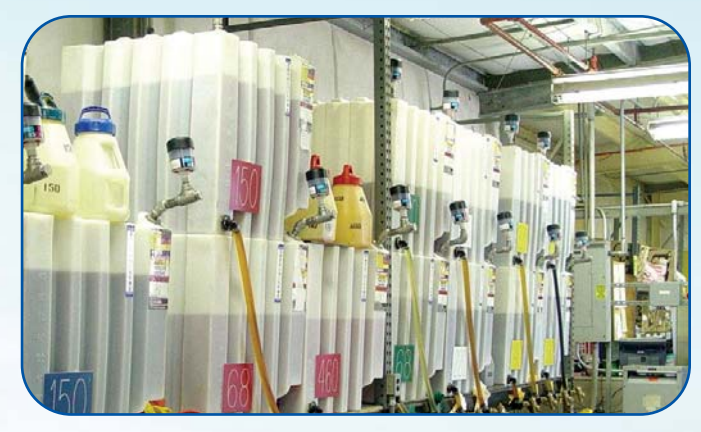
WORLD CLASS LUBE ROOM