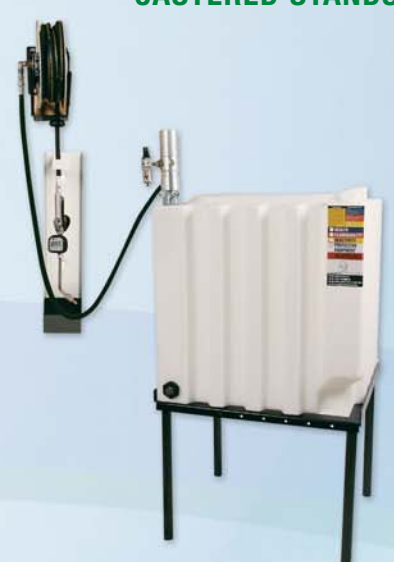
TANK MOUNTED PUMP SYSTEMS